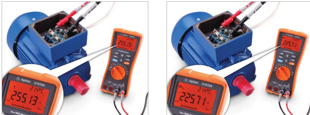
Figure 2: Comparison of voltage output from industrial motor VFD without and with Low Pass Filter functionality.

The U1270 series offers a 1 kHz LPF or Low Pass Filter to provide accurate Variable Frequency Drive (VFD) output measurement. This function eliminates high frequency noise and harmonics. This ensures the efficiency of your motor filter as well.