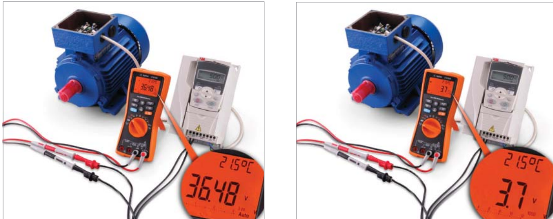
Figure 1: U1272A helps you identify the presence of stray voltage on a disconnected wire running parallel with the wire powering up the VFD to an industrial motor. The image on the right shows the U1272A in low impedance mode.

The U1272A is a dual input impedance digital multimeter. The DMM's high input impedance is preferred in most electrical measurements because it would not load the circuit under test. However, to obtain accurate measurements on circuits that may contain stray voltages, the U1272A's 2 k \Omega low impedance function comes in handy. Stray voltages are usually found in non-energized electrical wiring adjacent to powered wires due to capacitive or inductive coupling between these wires. When a pair of test leads is placed between the open circuit and neutral conductor, the circuit is then complete and forms a voltage divider in conjunction with the input impedance of the multimeter. High input impedance multimeter is sensitive enough to measure voltage coupled into the disconnected conductor, thus giving an inaccurate indication of a live conductor. The low impedance function serves to eliminate false readings by dissipating the stray voltages, thus improves safety and measurement efficiency during voltage.